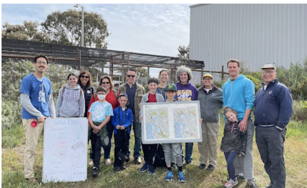
Pictured: Some of the 2022 Wetlands Restoration Day participants.