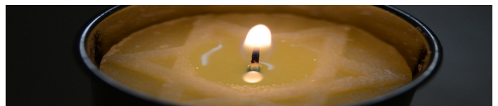
May their memory be for a blessing