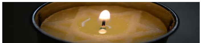
May their memory be for a blessing