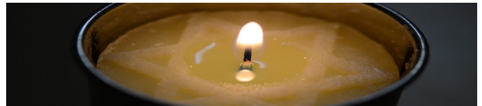
May their memory be for a blessing