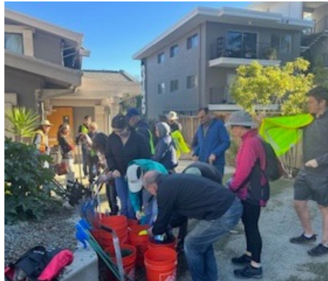
WTBA & Men's Club - MacArthur Blvd Cleanup Day